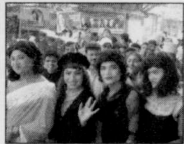
Nepalese gays and lesbians celebrate Pride in 2003