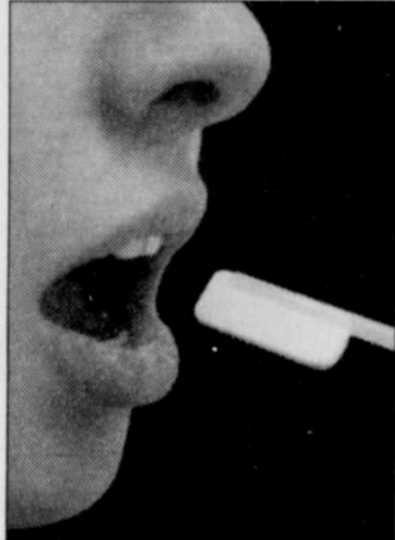
A quick blood draw and oral testing are available for free at Q-LAND's bar parties