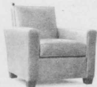
O'NEIL CHAIR Leather-Bicast Brown Special Purchase Value: $895