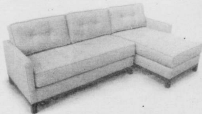
GRACIE SECTIONAL Passions Suede Camel Special Purchase Value: $1295