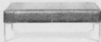
CEYLON OTTOMAN/TABLE Leather-Bicast Black Special Purchase Value: $395