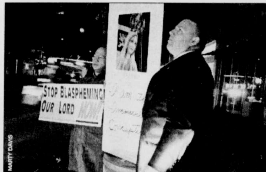
Members of the American Society for the Defense of Tradition, Family and Property protest Dec. 1 outside Hollywood Theatre

Portland is a city that takes pride in its volunteerism, and to show it, the City Council