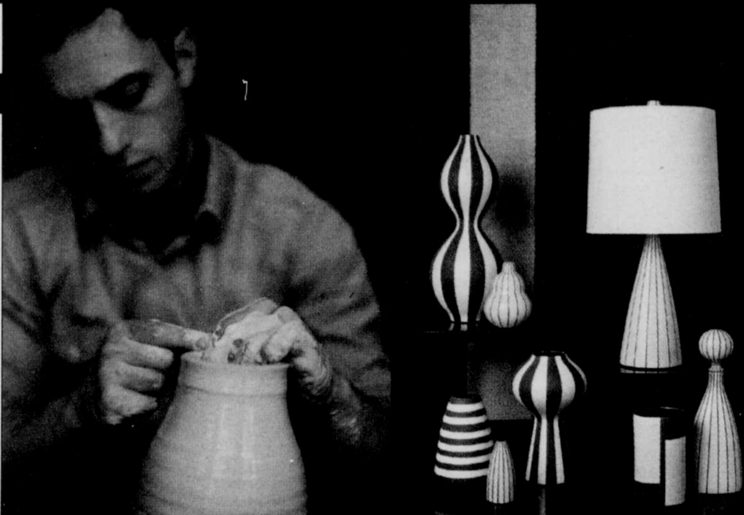
Jonathan Adler's vases and lamps appear on the sets of Will & Grace and The Ellen DeGeneres Show . Meet him Dec. 7.

Sneakin' Out and the Billy Shears Orchestra reprise their sold-out September performance of The Beatles' Sgt. Pepper's Lonely Hearts Club Band at Artichoke Music . (7 and 9 pm, 3130 SE Hawthorne Blvd. $17 at the door, $15 in advance from Artichoke Music .)