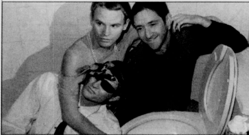
Art-rock trio The Dead Betties perform at Queercore Blitz on Dec. 3 in Portland and Dec. 5 in Eugene

The queer Mormon group Affirmation throws its annual holiday feast and