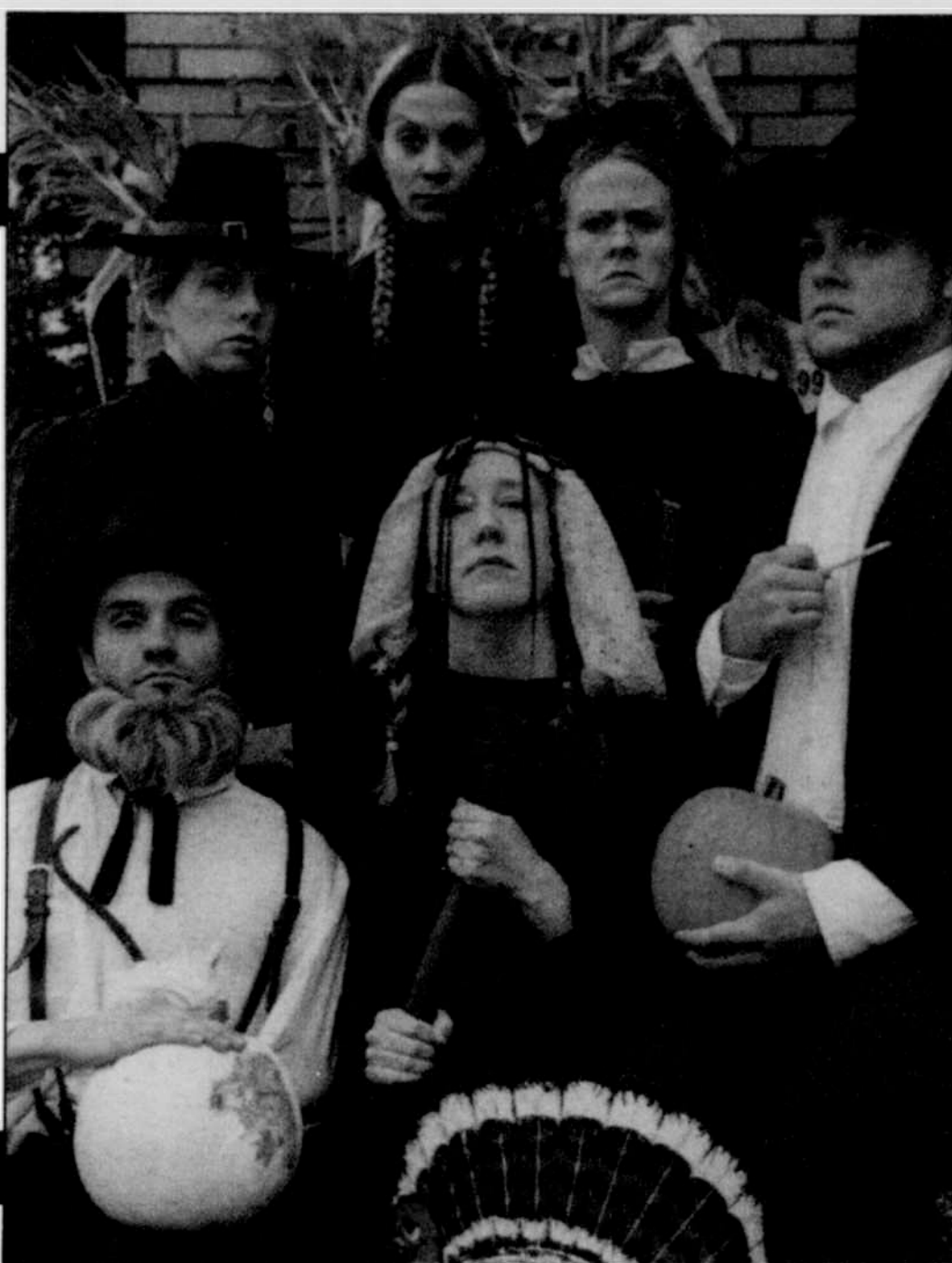
House of Cunt makes a pilgrimage to Nocturnal this month

Drag punk performance troupe Sissyboy wants your blood during Vampire Nurses from Hell! at C.C. Slaughters. Come shake your booty to DJ Francisco's contemporary dance mix and get a free HIV/STD test. (9 pm-midnight. 219 NW Davis St. $2. www.qland.org.)