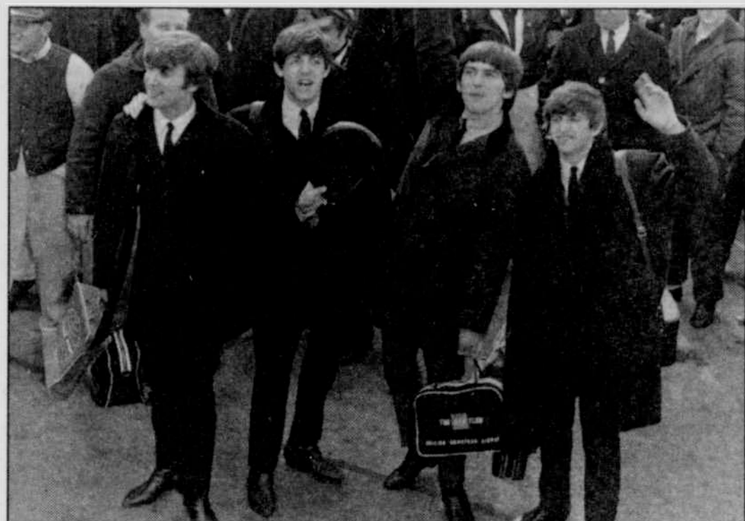
Beatlemania is back: The Photographic Image Gallery exhibits The Art of the Beatles through Dec. 30, and Sneakin' Out reinterprets Sgt. Pepper's Dec. 3 in Portland and Dec. 4 in McMinnville

music from the '30s, '40s and '50s. (8 pm. 618 SE Alder St. $15 from Music Millennium.)