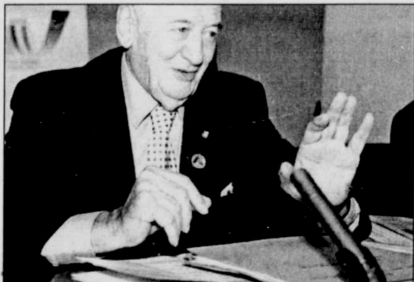
Italian Cabinet minister Mirko Tremaglia refuses to apologize for calling gays "faggots"