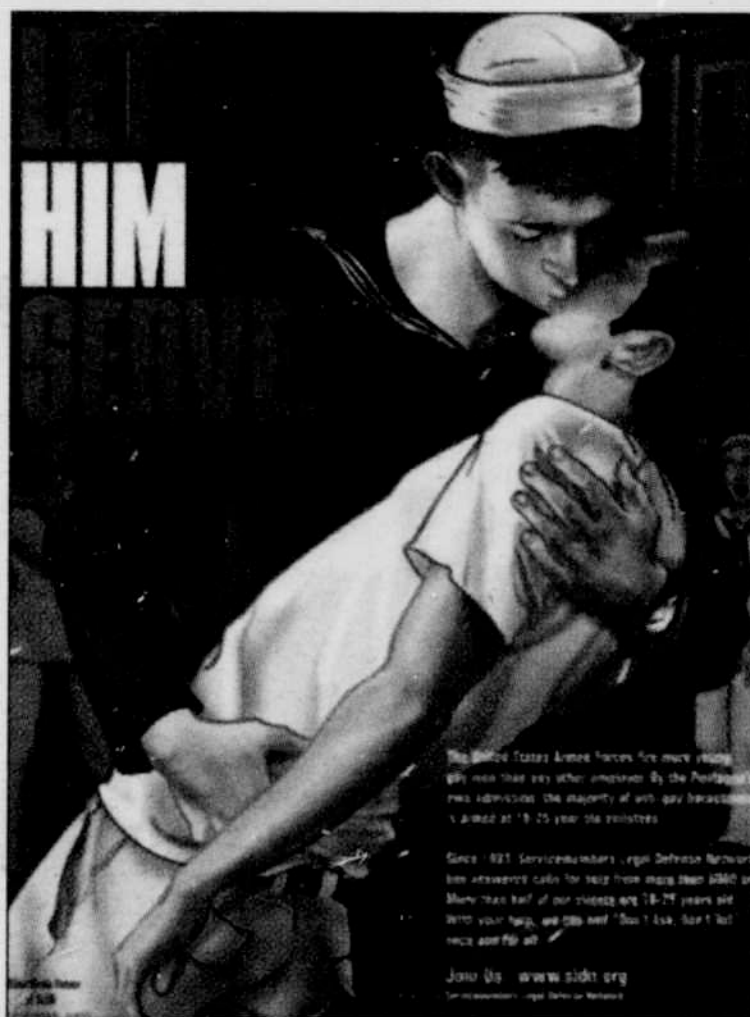
A new national ad campaign highlights the large number of young men ages 18 to 25 who are fired from military service because of their sexual orientation