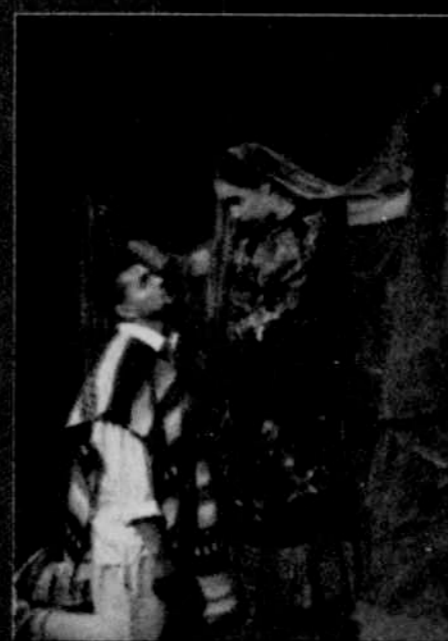
Miracle Theatre celebrates Day of the Dead starting Oct. 29

Gay-owned LaurelThirst holds its seventh annual Halloween's a Drag Show starring employees and pub regulars. The Billy Kennedy Band performs, too. (9:30 pm, 2958 NE Glisan St. $3. 503-232-1504.)