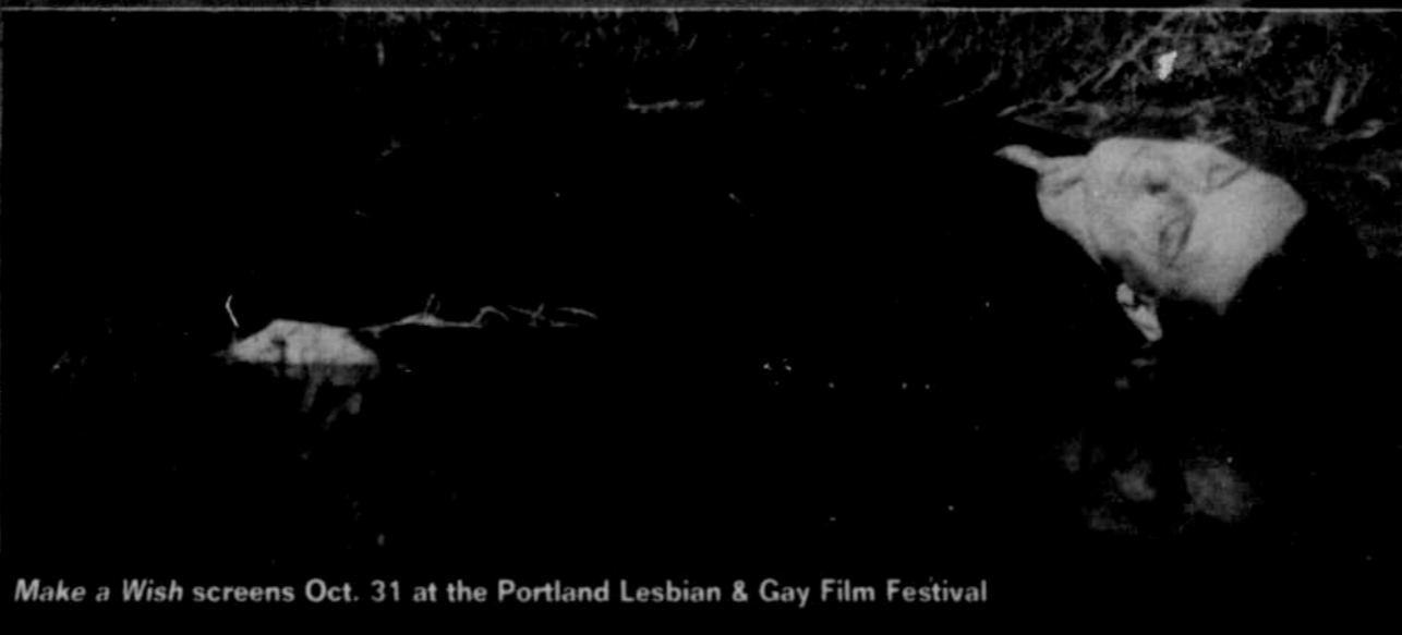
Make a Wish screens Oct. 31 at the Portland Lesbian & Gay Film Festival

The Rosetown Ramblers present the ninth annual Scares & Squares featuring square dancing, a banquet, a brunch and a costume party with prizes through Oct. 31 at the Sauvie Island Grange. (14443 NW Chariton Road. $75. www.rosetownramblers.com .)