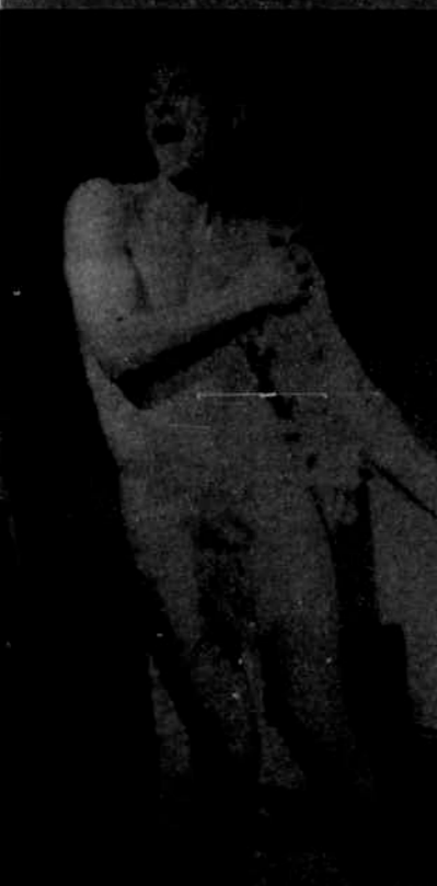
Prepare to get messy with P.A.N. at The Language of Monsters on Oct. 30

La Buket Fantastique. (5-10 pm, 1001 SE Morrison St. $5. portlandiva@hotmail.com .)