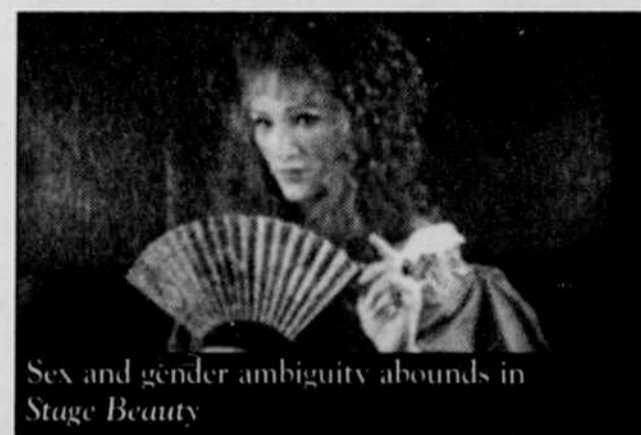
Sex and gender ambiguity abounds in Stage Beauty

interplay, but so do Crudup and devilishly handsome Ben Chaplin, who plays an aristocratic theater patron. The film's tone is mostly zippy and Wildean; it's funny, fast-paced, slightly frivolous, sexually adventurous and ultimately rather smart.