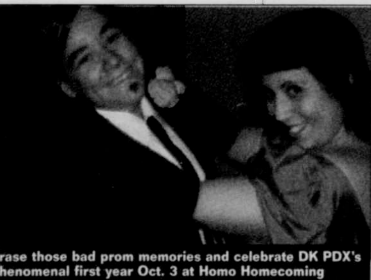
Erase those bad prom memories and celebrate DK PDX's phenomenal first year Oct. 3 at Homo Homecoming

Eclectic world music guitarist Richard Colombo performs at Wild Abandon. (8:30 pm, 2411 SE Belmont St. 503-232-4458.)