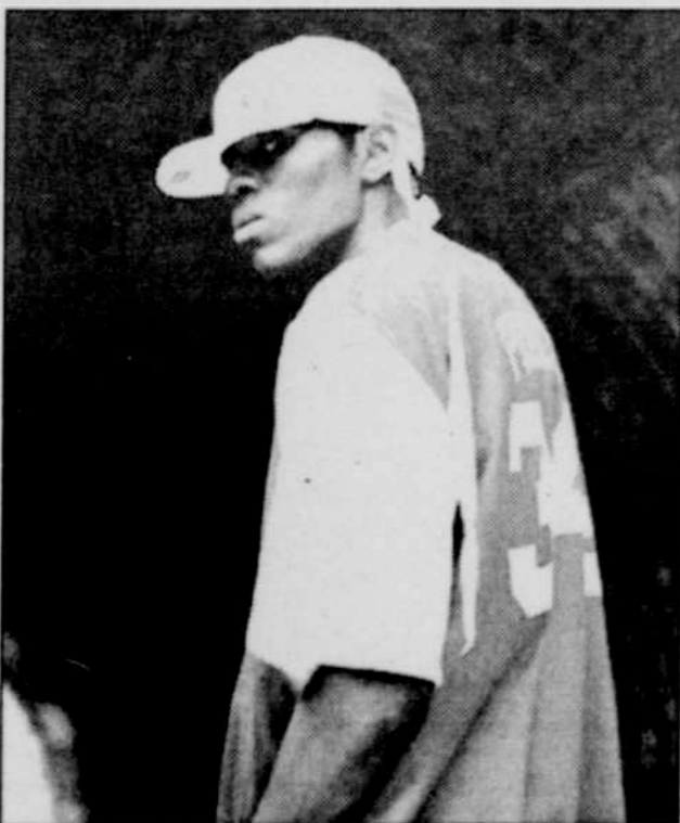
Singer Vybz Kartel was un-nominated for a MOBO award because of his anti-gay lyrics