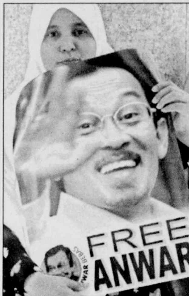
A supporter of former Malaysian Deputy Prime Minister Anwar Ibrahim protests his imprisonment near Kuala Lumpur in January