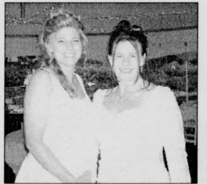
calla lilies. The couple will spend their honeymoon traveling through the Greek islands.

Each bride chose to wear ivory designer gowns and carry a bouquet of white French-wrapped