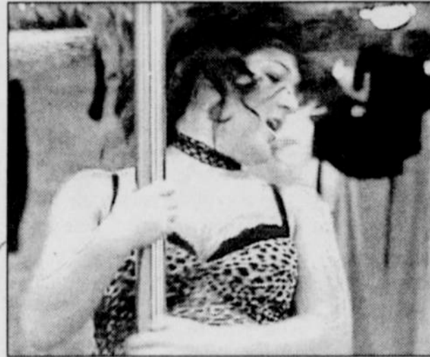
Trans champ Nadia Almada gets frisky on the U.K. version of Big Brother