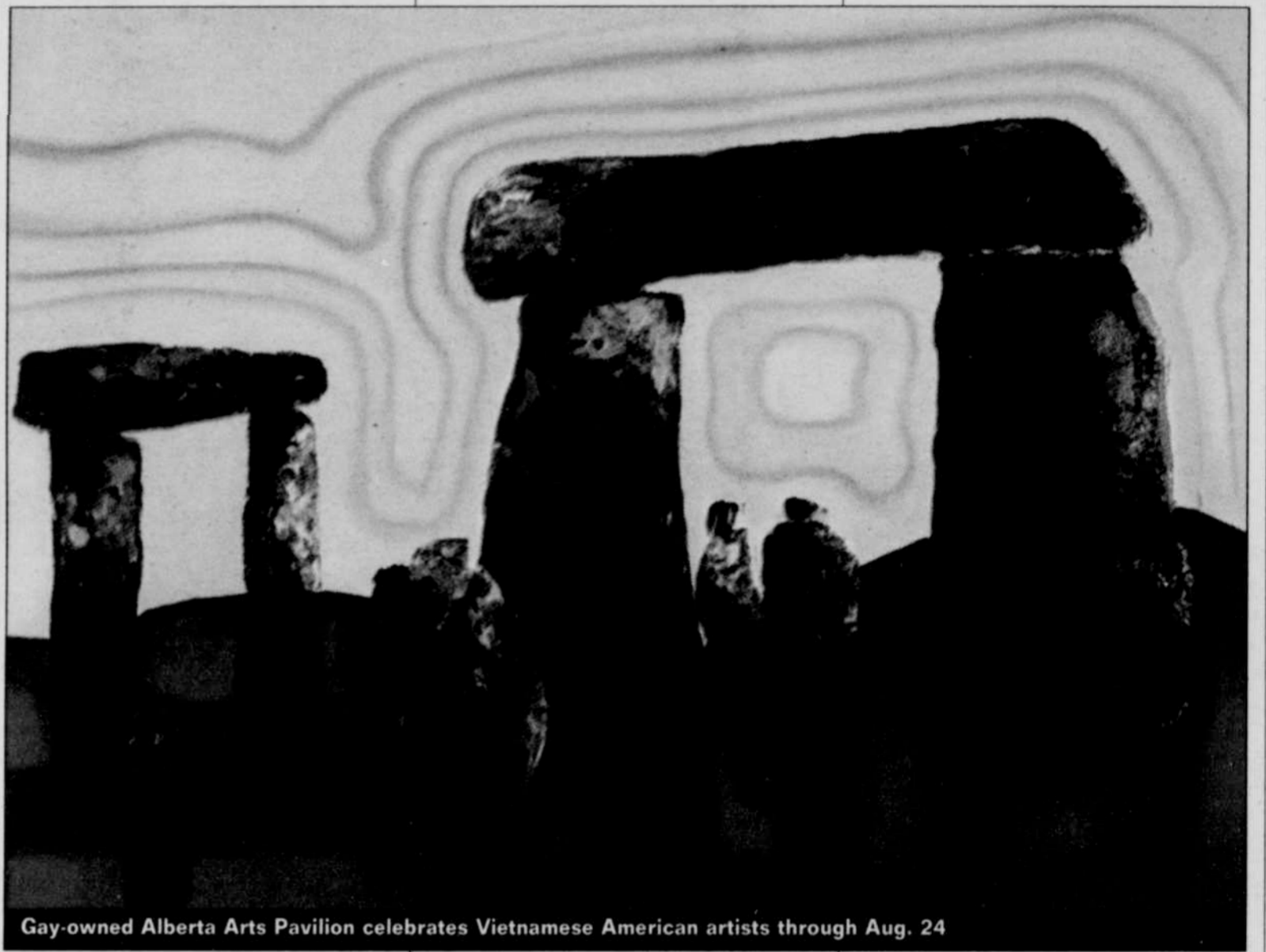
Gay-owned Alberta Arts Pavilion celebrates Vietnamese American artists through Aug. 24