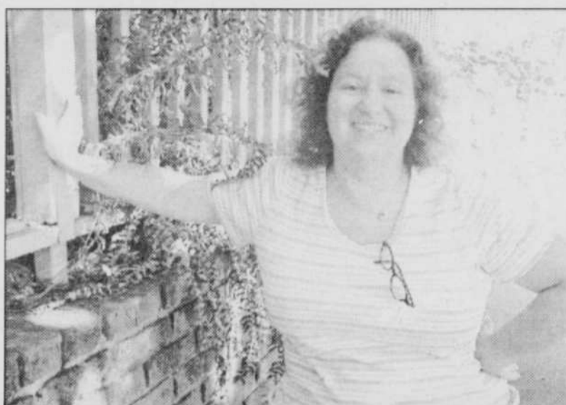
"The more you can make a safe space to explore fantasies, wishes and turn-ons, the better"

Cody agrees: "Testosterone matters!" Likewise, she says, "Chronic pain, fibromyalgia and other chronic illness also can put quite a damper on sexual desire."