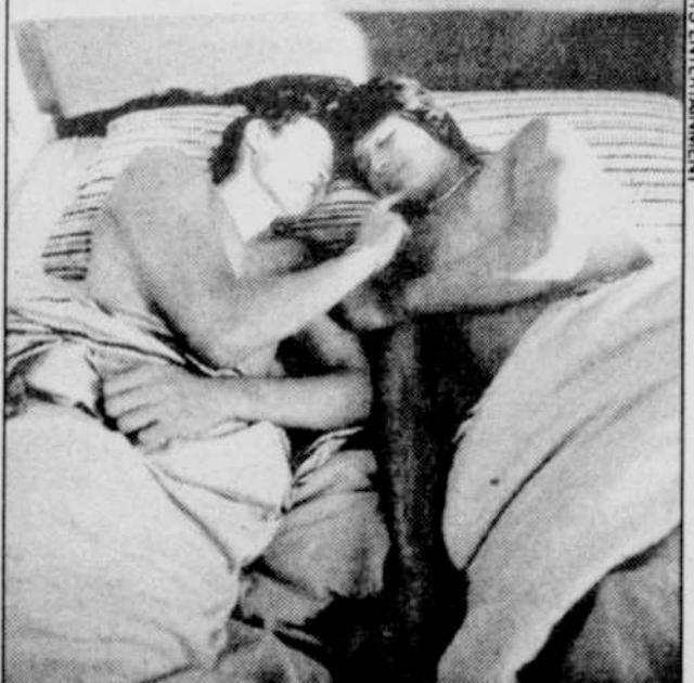
Singapore banned the Taiwanese film Formula 17 because it "creates an illusion of a homosexual utopia"