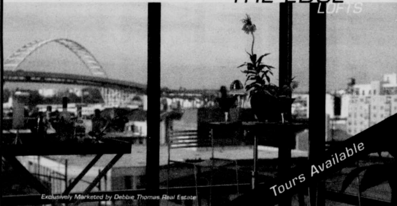
Exclusively Marketed by Debbie Thomas Real Estate