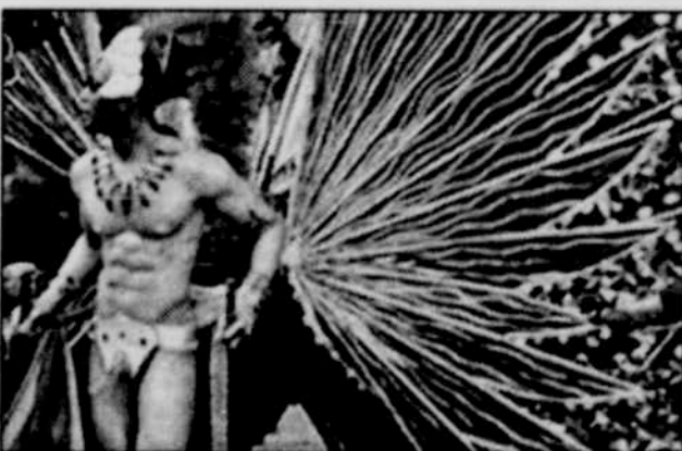
Toronto Pride was "Bursting with Fruit Flavors"

The survey questioned 83,729 Canadians between ages 18 and 59. It found that younger people are more likely to own up to their sexuality than older folks. About 2 percent of people between 18 and 34 came out to questioners as