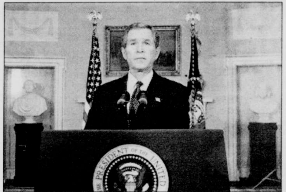
President Bush slammed same-sex marriage in his weekly radio address July 10

Conservatives opened up debate on the amendment July 9 with what has by now become a hackneyed litany of charges against "unelected judges" undermining "traditional marriage" and claims that the only way to save the country is by amending the Constitution.