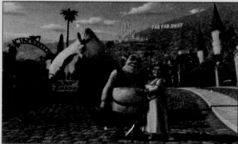
Right-wingers are pissed at Shrek 2 for “promoting cross-dressing and transgenderism”

A computer-generated movie, Shrek 2 has become the highest-grossing animated hit in domestic box office history, bringing in more than $364 million in just its first four weeks.