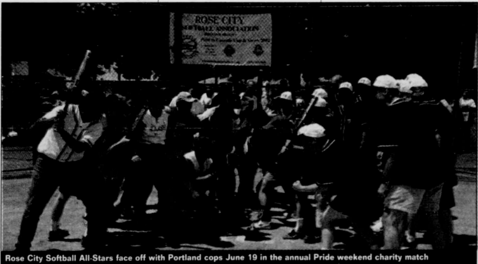
Rose City Softball All-Stars face off with Portland cops June 19 in the annual Pride weekend charity match

Join the Adventure Group for a 10-mile hike of Wildcat Mountain . (9 am. www.adventuregroup.org.)