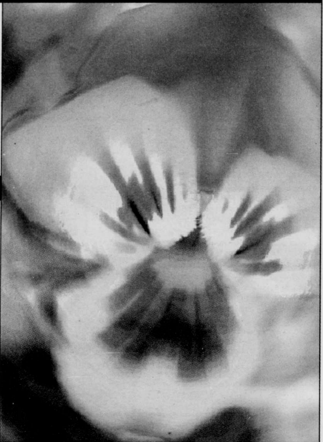
Page Jordan's beautiful photography joins other mixed-media work on the Barnes & Noble Art Wall at Jantzen Beach

Sashay on wheels when Camp Starlight teams up with Rosetown Ramblers for a Pride Roller Skating Party at Oaks Park. (7:30-9:30 pm. 1 SE Spokane St. $5.)