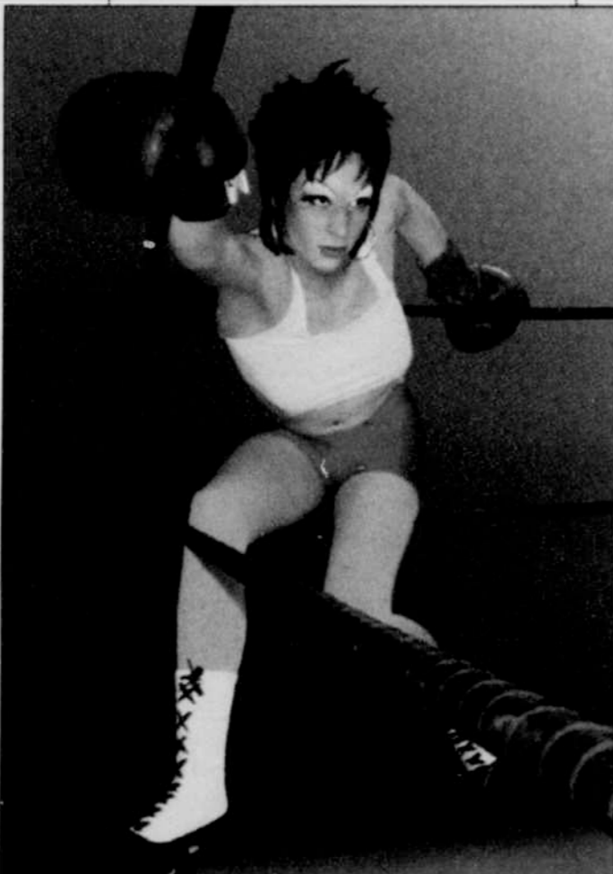
You'll wind up kicking your own ass if you don't attend Nocturnal's Dragup Knockdown on June 18

The Imperial Sovereign Court of the Emerald Empire presents the annual Closet Ball 2004 , a gender-bending night of fun in which a new "Closet King or Queen" is crowned at Neighbors in Eugene. (8 pm. 1417 Villard St. $5.)