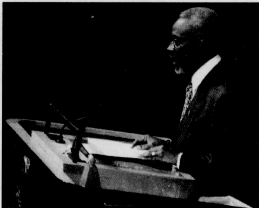
Amnesty International is urging Jamaican Prime Minister P.J. Patterson to protect gays from violence and to legalize gay sex

"The crowd stood around watching, chanting 'Battyman, battyman, battyman,'" he said. "They beat, punched and kicked him, and then they dragged him down the road for half a kilometer. They shouted, 'Battyman fi dead.' As I stood across the street, I realized there was nothing I could do to help him. Some mothers were actually in tears at what they were witnessing, but there was nothing that they could do either. The crowd was saying: 'Give him to us! Let us kill him! He's a battyman!'"