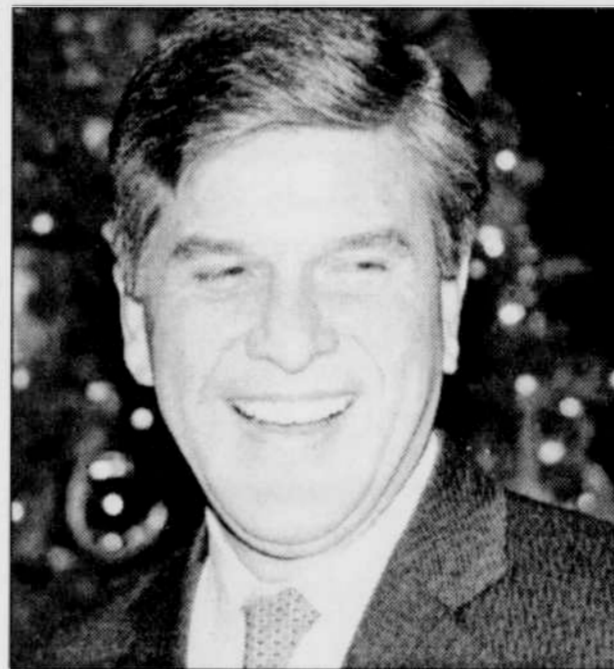
U.S. Sen. Gordon Smith, R-Ore., opposes anti-gay hate crimes but supports the anti-gay Federal Marriage Amendment

cannot. What Sen. Kennedy and I propose to do would change that and change it for the good."