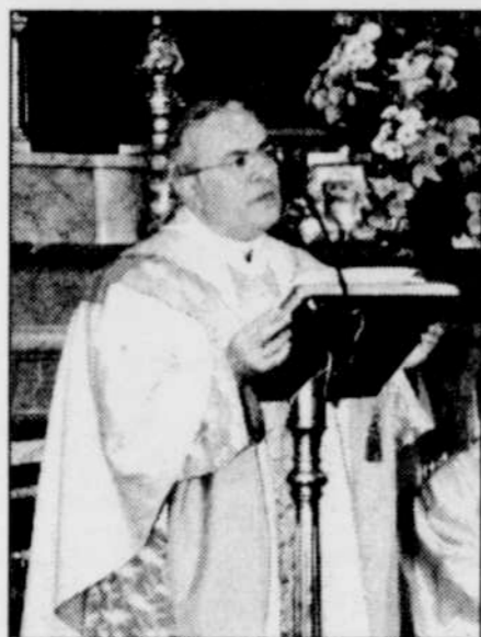
Archbishop Manuel Monteiro de Castro contradicted the Vatican by expressing his support for same-sex unions

Three Australian gay couples are suing to force recognition of their Canadian marriages under provisions of the Commonwealth Marriage Act. Same-sex marriage is legal in Massachusetts, Belgium, the Netherlands and the Canadian provinces of British Columbia, Ontario and Quebec. Canada has no residency requirements for marriage.