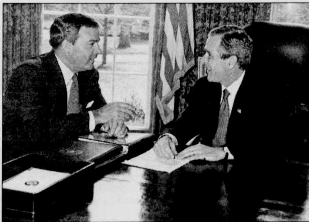
Activists are urging Connecticut Gov. John Rowland (left, with President Bush at the White House) to sign a trans-inclusive hate crimes bill