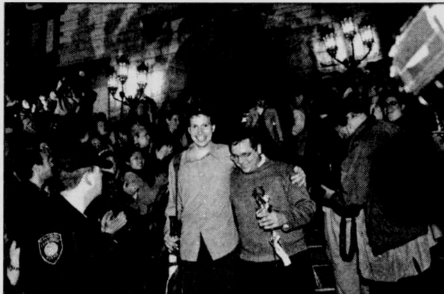
Crowds cheer couples leaving Cambridge City Hall after applying for marriage licenses