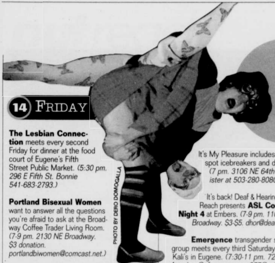
Clowns gone wild! Nomadic Theater presents The See-Saw Project through May 16.