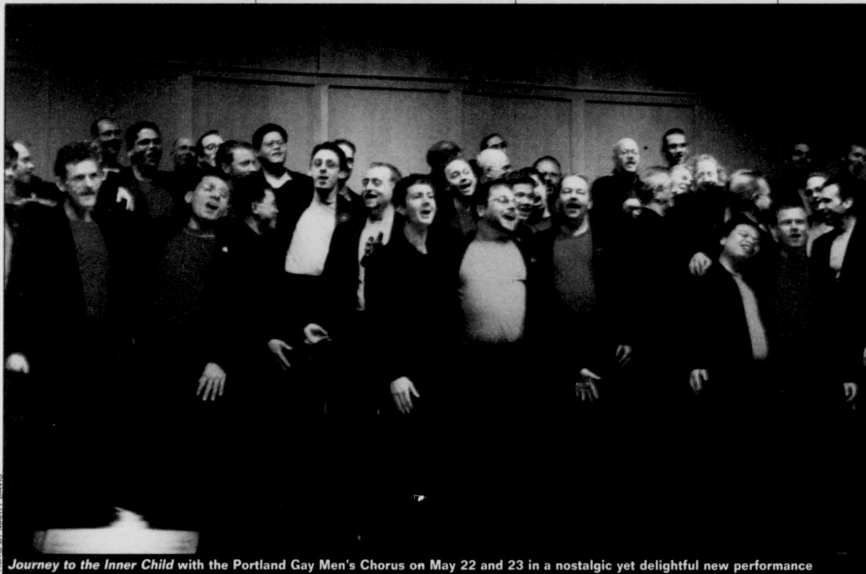
Journey to the Inner Child with the Portland Gay Men's Chorus on May 22 and 23 in a nostalgic yet delightful new performance