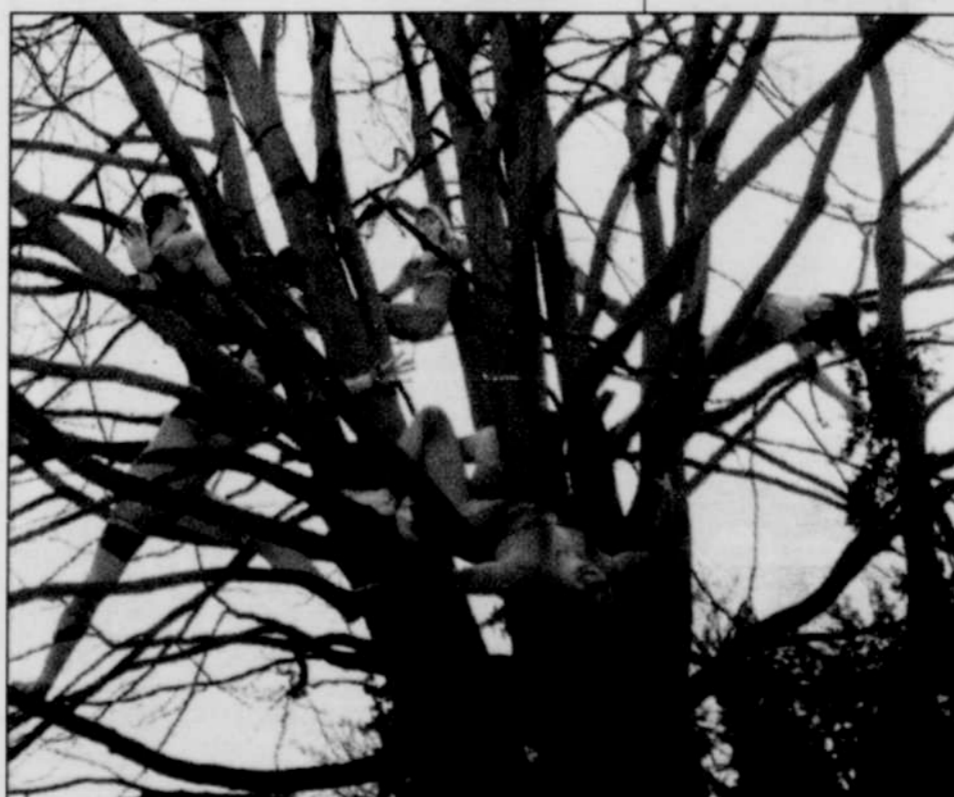
Do Jump! is back with its most ambitious production in 26 seasons