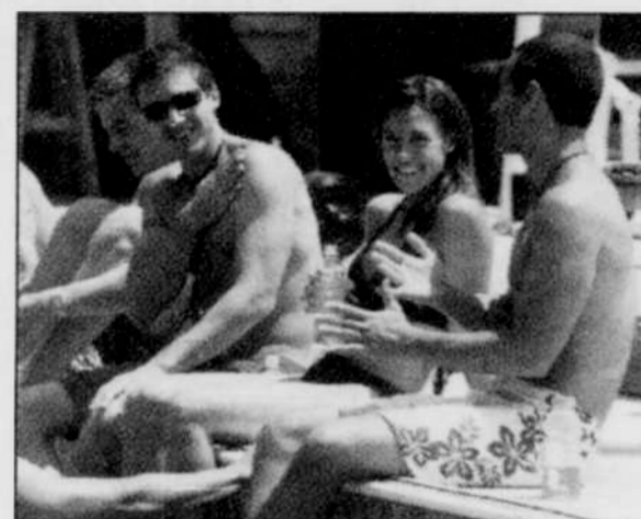
So long cute boys of Playing It Straight