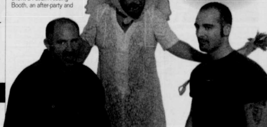
"Find a nice man, already, you're breaking my heart!" Let QLAND help you out during its Yenta Matchmaking Party on May 7 at C.C. Slaughters.

Celebrate women of substance during FatGirl Speaks: A Celebration of Size, Self & Sexuality at Roseland Theater. An all-day event with workshops, a fashion show, a FatGirl Kissing Booth, an after-party and