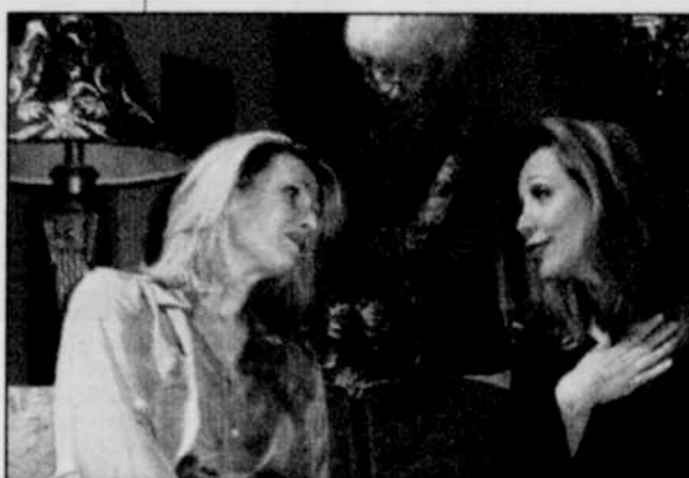
How much trouble can one middle-aged housewife get into? The Tale of the Allergist's Wife opens April 23 at Theater! Theatre!

Portland's own sexy, sassy queer pop rocker Ashleigh Flynn jams at Mississippi Pizza Pub. (7 pm. 3552 N Mississippi Ave.)