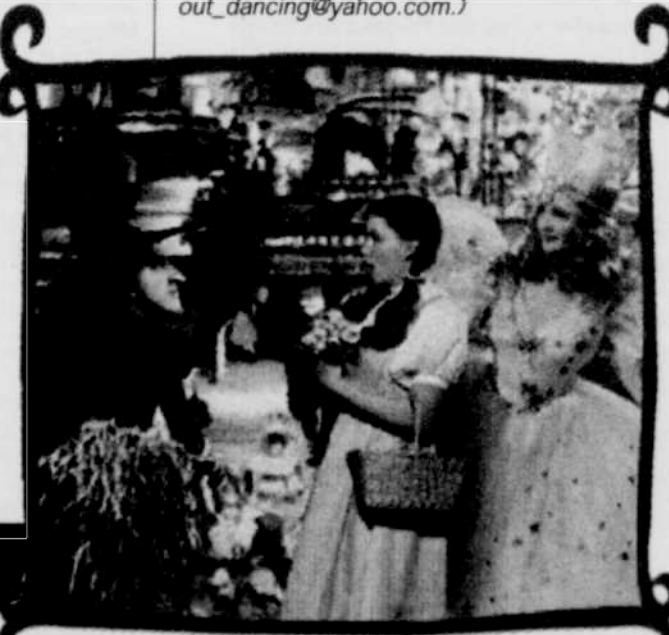
Gay Night at Sing-a-Long Wizard of Oz April 17. Does life get better than this?

Out Dancing's beginning nightclub two-step starts tonight and continues every Friday in May at Ankeny Street Studio. Level 11 swing follows. (7-8 pm two-step $20 for month), 8-9 pm swing $32 for month). Southeast Ninth Avenue and Ankeny Street. 503-236-5129. out_dancing@yahoo.com.)