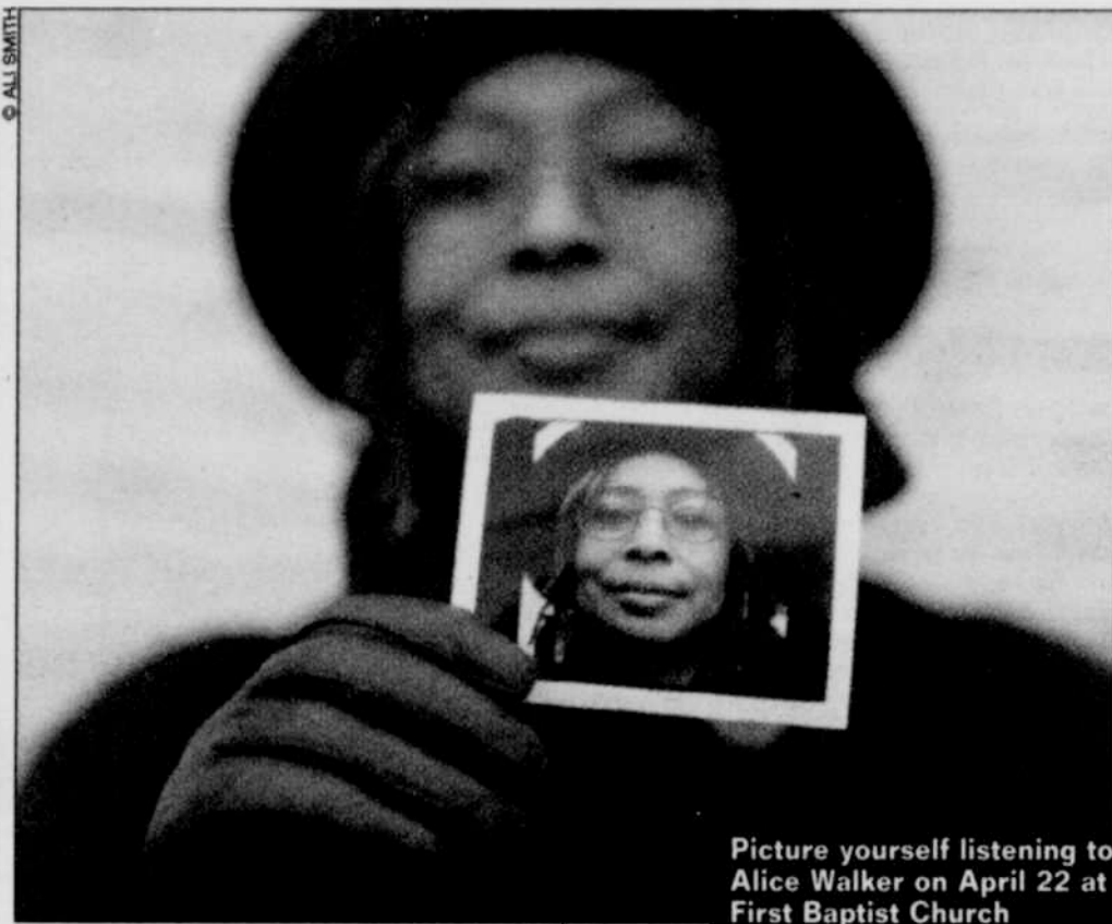
Picture yourself listening to Alice Walker on April 22 at First Baptist Church