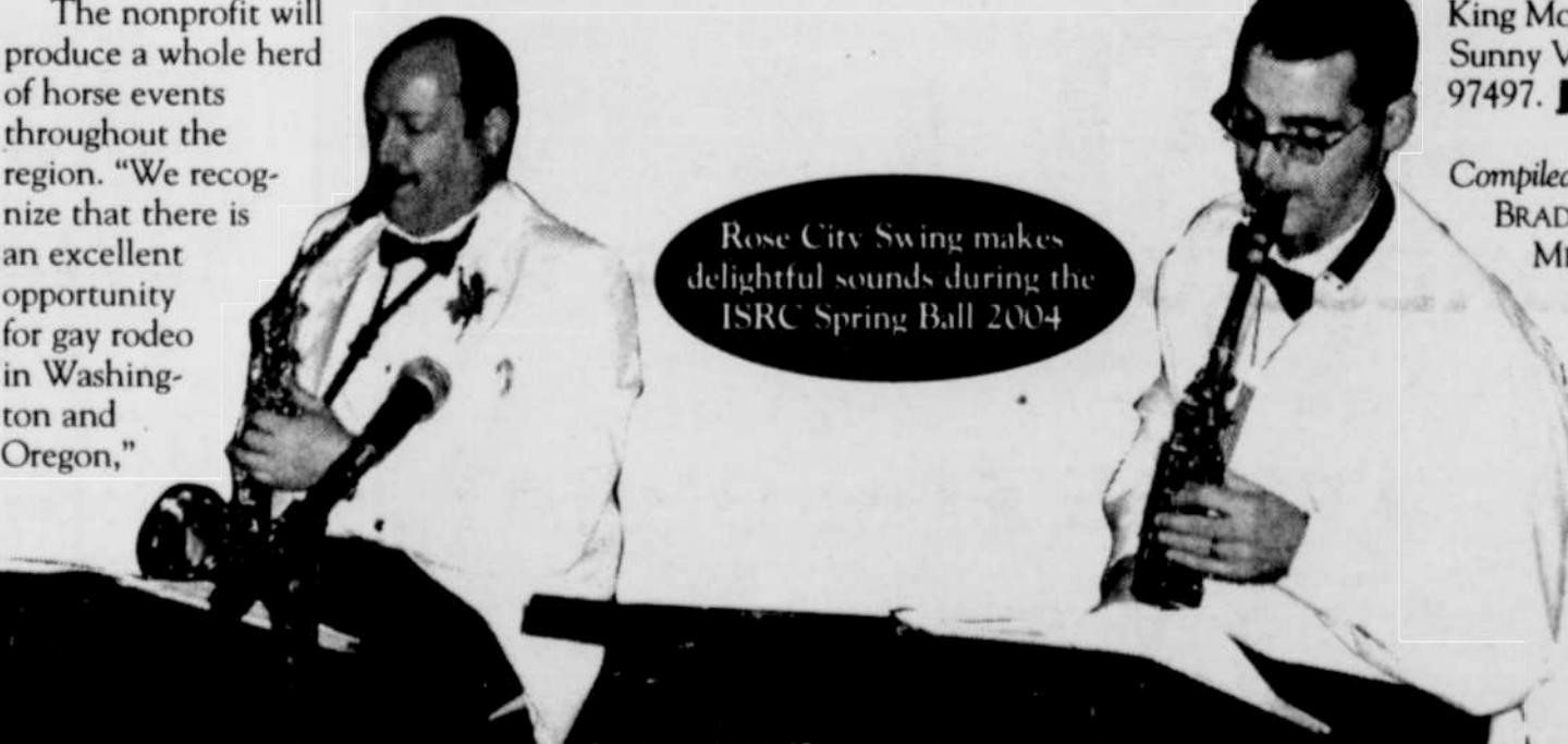
Rose City Swing makes delightful sounds during the ISRC Spring Ball 2004