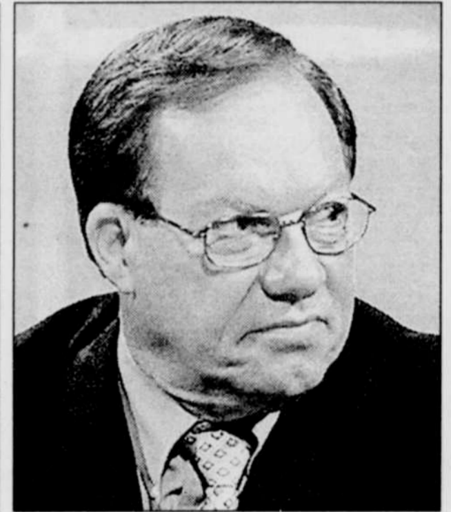
Sen. Wayne Allard, R-Colo., claimed he tinkered with the Federal Marriage Amendment to make his original intent more clear

Openly gay Rep. Barney Frank, D-Mass., was at his most combative as the second witness on the panel of experts. He said the wording of the