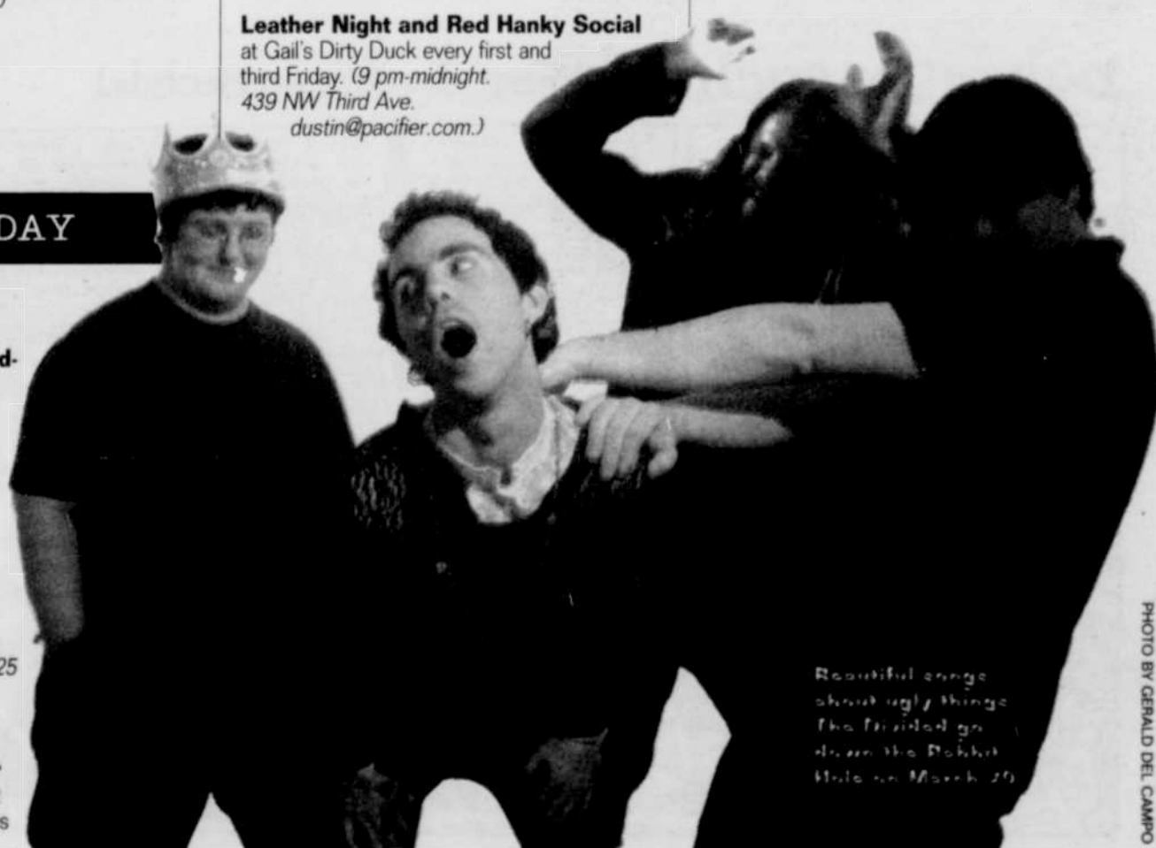
Beautiful songs about ugly things. The friends go down the Rabbit Hole on March 29.

A benefit concert for The Haven Project at the Meow Meow features