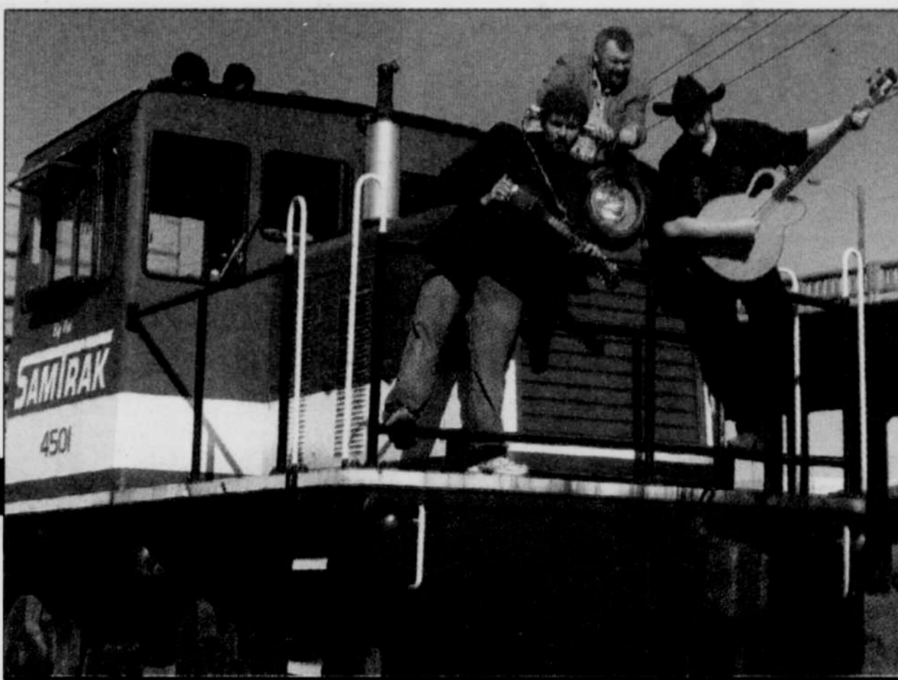
Queer trio Sneakin' Out shows up all over the place in March with their rather inspired countrified blend of pop and rock covers

In Other Words presents The Last Word Open