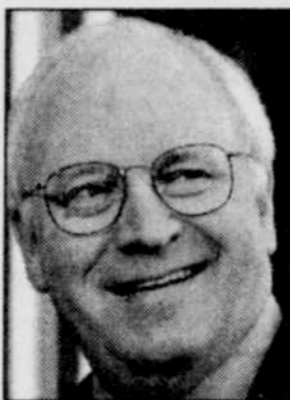
Dick Cheney's words are coming back to haunt him

Log Cabin Republicans launched an unprecedented $1 million national advertising campaign March 10 opposing the Federal Marriage Amendment. The proposal would not only deny civil marriage rights for same-sex couples but also jeopardize civil unions and domestic partner benefits.