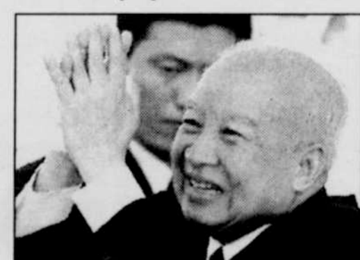
Cambodian King Norodom Sihanouk supports same-sex marriage

The poll also found that political conservatives and people who live in "the bush" are less gay-supportive than liberals and city dwellers.