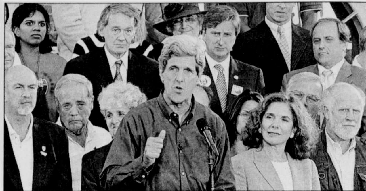
Presidential candidate John Kerry supports an anti-gay amendment to the Massachusetts Constitution