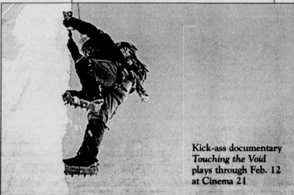
Kick-ass documentary Touching the Void plays through Feb. 12 at Cinema 21

This excruciating documentary gives us a front-row seat to a near-deadly 1985 mountain climb in Peru. Using re-enactments as well as intense interviews with survivors Joe Simpson and Simon Yates, director Kevin Macdonald ( One Day in September ) cranks up the drama