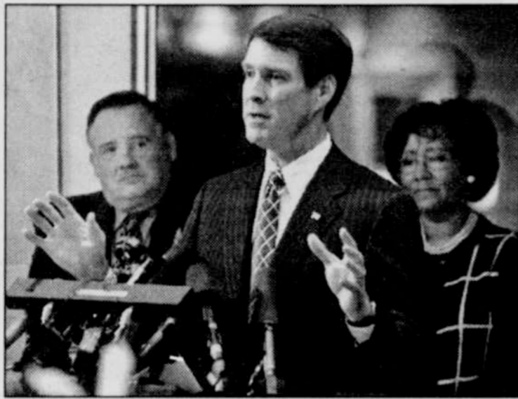
Republican Senate Leader Bill Frist of Tennessee told conservatives last month that gay families do not exist

Addressing the Republican National Committee's winter meeting Jan. 29, chairman Ed Gillespie blasted "unelected, activist judges" for recognizing marriage equality in Massachusetts while ridiculing U.S. Sens. John Edwards,