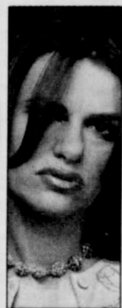
Sandra Bernhard sashays into Portland Feb. 12

Comedian, actress, vocalist and bisexual bad girl Sandra Bernhard takes the stage at the Roseland on Feb. 12 and 13. Special cocktail seating available. (8 pm. 8 NW Sixth Ave. $29.50-$50 from TicketsWest.)