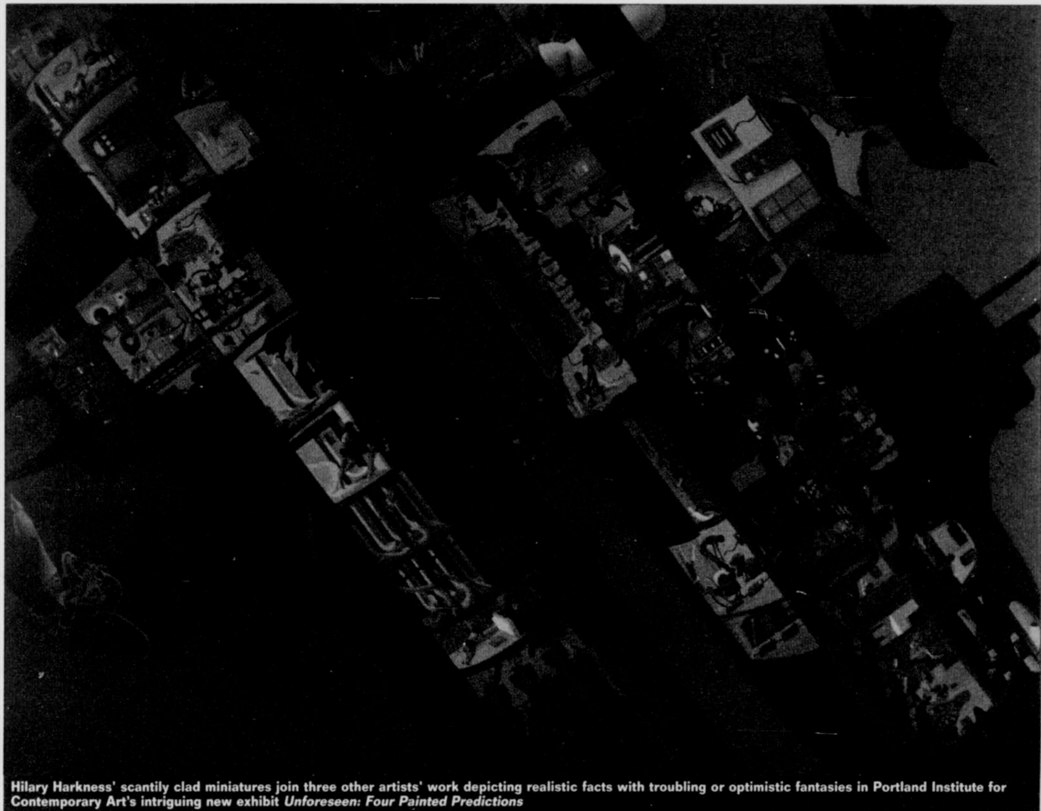
Hilary Harkness' scantily clad miniatures join three other artists' work depicting realistic facts with troubling or optimistic fantasies in Portland Institute for Contemporary Art's intriguing new exhibit Unforeseen: Four Painted Predictions

Pay tribute to Dr. King's extraordinary contributions to the pursuit of equal rights during the free Martin Luther King Jr. Celebration at Eugene's Hult Center. (6 pm. One Eugene Center. www.hultcenter.org .)