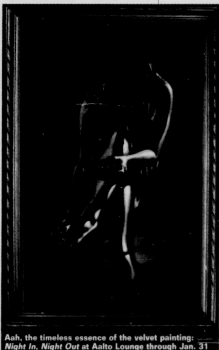
Aah, the timeless essence of the velvet painting: Night In, Night Out at Aalto Lounge through Jan. 31