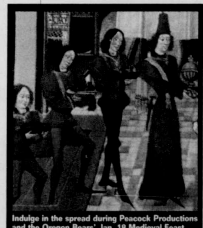
Indulge in the spread during Peacock Productions and the Oregon Bears' Jan. 18 Medieval Feast