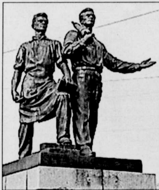
A Lithuanian sculptor insists his models are socialists, not queers