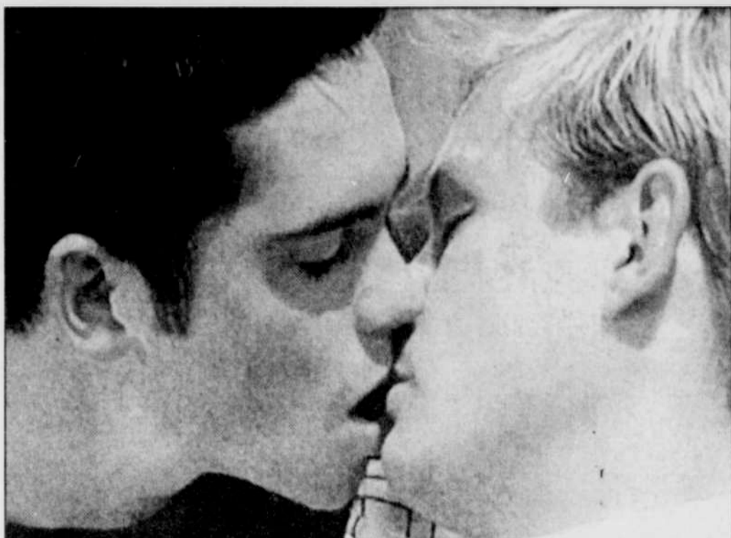
A confused Todd Grimshaw homes in to lock lips with Nick Tilsley for the first gay kiss in the 43-year history of the U.K. soap Coronation Street

Britain is removing more than 300 people from its sex offender registry because they were convicted of crimes that will no longer exist come next May—buggery and gross indecency between men. The crimes will disappear when the sex offenses bill now moving through Parliament reaches the statute book, The Guardian said.