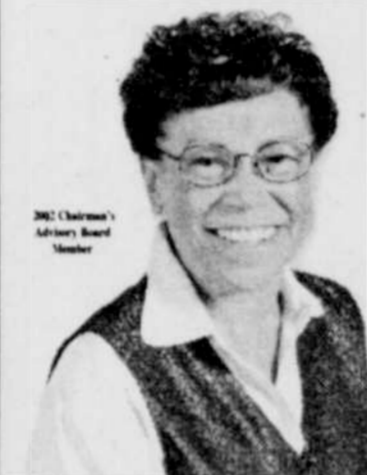
2002 Chairman's Advisory Board Member

Invest a little time and I'll take it from there.