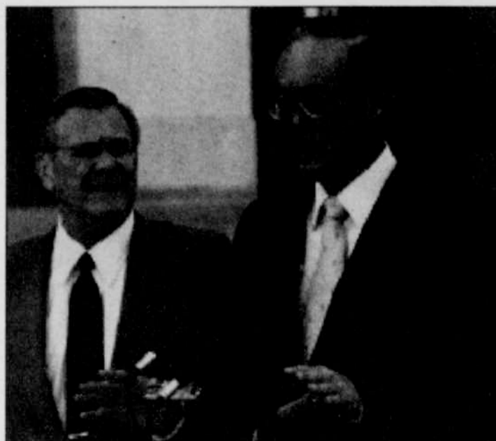
Singapore Prime Minister Goh Chok Tong (right, with U.S. Defense Secretary Donald Rumsfeld) has started appointing queers to fill sensitive government positions

The city of Ottawa's float was one of the parade's largest. It displayed a huge banner that read, "Sex in the City: Don't Forget to Wrap It Up." City workers distributed condoms to spectators as the float moved along.