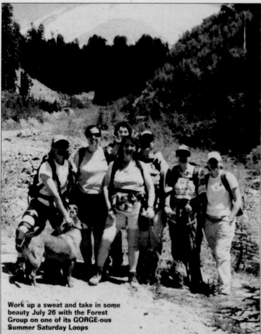
Work up a sweat and take in some beauty July 26 with the Forest Group on one of its GORGE-ous Summer Saturday Loops