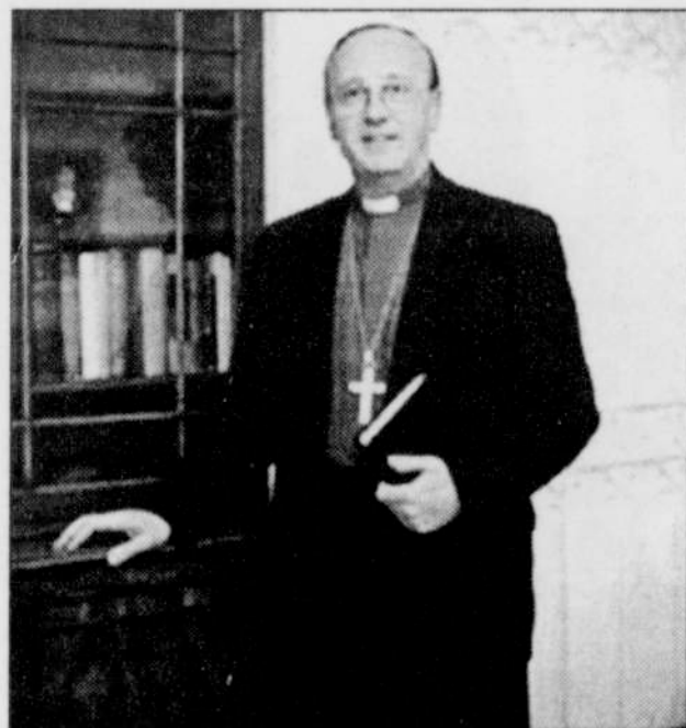
Conservatives claim the promotion of openly gay York, England, Archbishop David Hope threatens the very existence of the Anglican Communion

São Paulo has almost 100 gay bars and restaurants and is considered to have Latin America's best gay scene. More than 20 other Brazilian cities also celebrate Gay Pride.