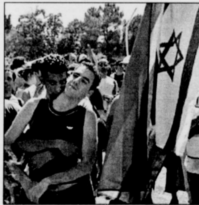
Israelis show their Pride on June 20 in Jerusalem