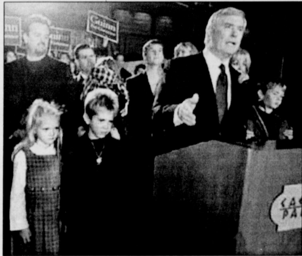
Nevada Gov. Kenny Guinn has signed a bill granting hospital visitation rights to same-sex couples

Republican Gov. Kenny Guinn has signed legislation concerning the hospital visitation rights of patients and providing a new classification for people who may participate in the disposition of a deceased person.